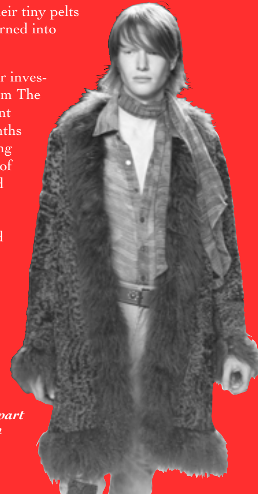
A model sports a karakul lamb coat, part of a fashion designer's collection.

Undercover investigators from The HSUS spent twelve months documenting the source of this fur and debunking the myths perpetrated by the fur industry.